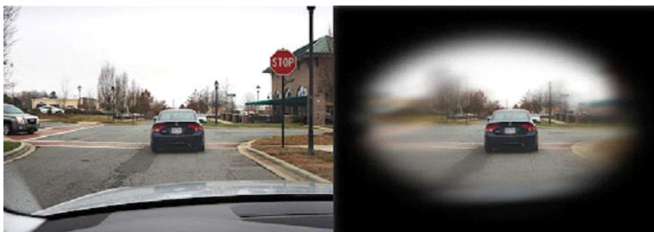
The degree of peripheral vision loss varies based upon severity of disease.